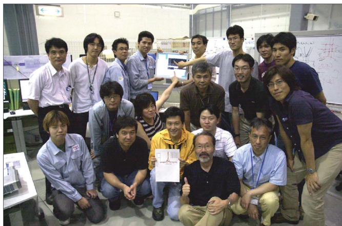
The Joint-Project Team on the day that lasing at 49 nm was achieved.