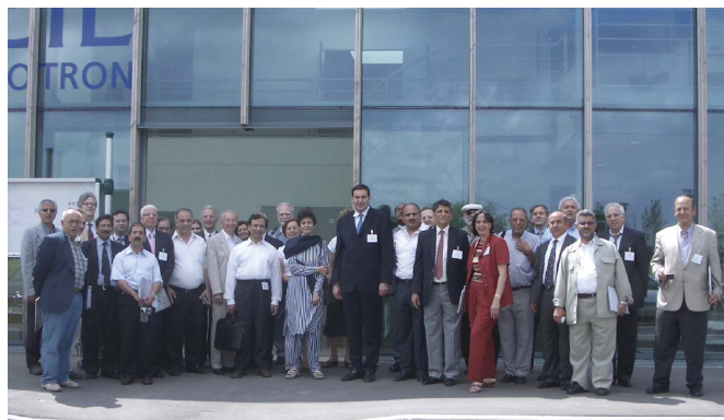
Members of the SESAME Council and UNESCO delegates at SOLEIL.